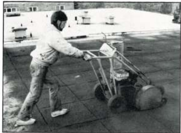
Cuts cleaner — Holds up longer

Garlock's new Angler Blades are designed to handle the toughest jobs — including resaturated BUR's.