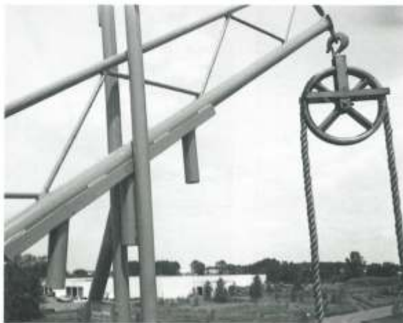
Hoisting wheel and rope not included.

Quickly lift lightweight mechanical equipment, tools, materials, and other objects to rooftop worksites with Garlock's Hand Power Hoist. The hoist sets up in just a couple minutes — no tools required. Plus, the boom can be set at three different angles to ensure full clearance with bulky equipment and parapet walls. The Hand Power Hoist easily supports loads of up to 300 pounds when used with Garlock's optional counterweight system. And it dismantles just as quickly as it assembles — no tools required.