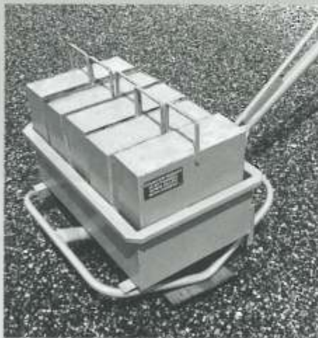
The optional counterweight system locks into place for safe and steady lifting.