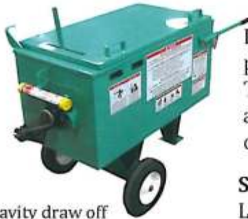
Gravity draw off

Lightweight and compact, this kettle is ideal for small patch jobs. It fits in the back of a pickup and elevators. The 30 Gallon RAM Mobile Melter runs on a LP vapor torch and includes a 15" LP hose and regulator, 2 1/2" draincock and thermometer.