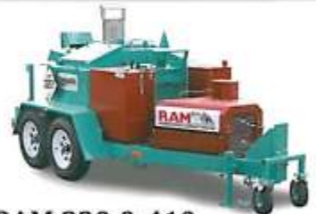
RAM 230 & 410