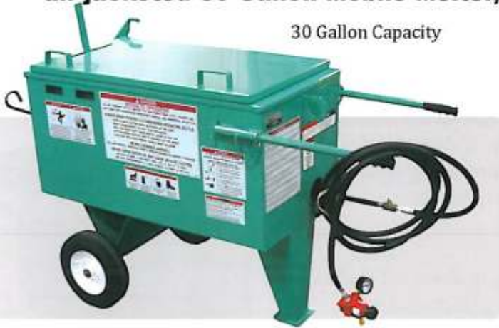
30 Gallon Capacity

The 30 Gallon RAM Mobile Melter is an air-jacketed rubberized asphalt melter. Because rubberized asphalt materials melt at lower temperatures than conventional roofing asphalt, the flue unit is located underneath a material containment chamber. This chamber protects sensitive asphalt materials from the high BTU output burner which could scorch this material. The air chamber between the flue and material chamber offers efficient heat transfer with out direct material contact.