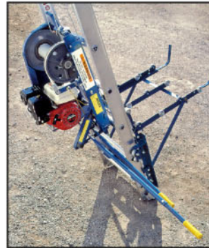
400 lb. Platform Hoist w/ Classic Power Drive

Platform Hoists are easy to transport and assemble and require minimum maintenance. A variety of available accessories makes RGC Platform Hoists the most versatile on the market.