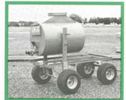
HAULS HOT STUFF (Shown with Garlock's 55 Gal. Insulated Tank)