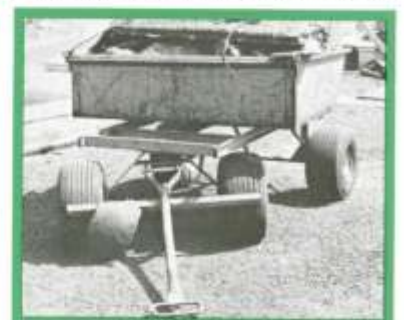
HAULS TEAR OFF DEBRIS (Shown with Garlock's Trash Tray)