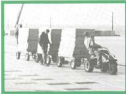
above: Trailers with optional 4.80/4.00 x 8 tires, connected in series.