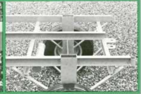
Rugged channel construction