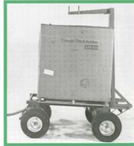
right: Trailer adapts to combination Hoist Hooks for easy pallet unloading