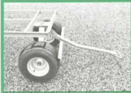
Drop the handle - brake is on.