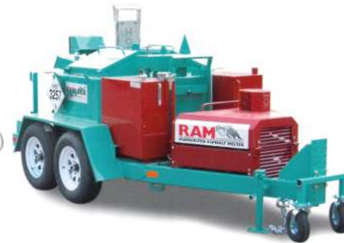
RAM 230 & 410

RAM by Garlock Equipment sets a new standard of efficiency in the heating of heat-sensitive rubberized asphalt materials. Garlock delivers the highest degree of quality construction, productivity and innovation available today. Bottom Line - RAM delivers the best return-on-investment for the money and will continue to make you more money year after year. Check out our features and see why RAM Melters are simply the best!