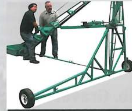
Set up hoist a safe distance from edge of roof then wheel into position, remove wheels and begin hoisting operations.

Power Swing In and Out with Precision Control.