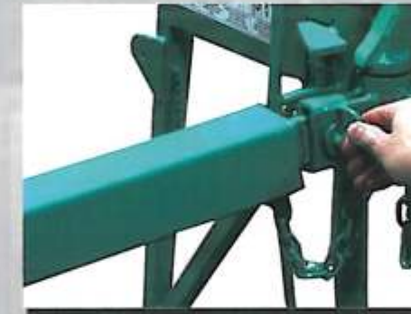
"Receiver Hitch" type assembly. No aligning bolt holes for easier, quicker assembly.

Swing Arm Can Be Setup To Swing In To the Right or Left.