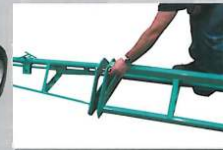
A-Frame and Boom can be disassembled to fit into elevators.

Additional Clearance on Side Leg Support to Handle Large Bulky Loads.