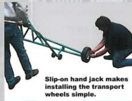
Slip-on hand jack makes installing the transport wheels simple.

Only 9 Major Components Make Setup Fast and Simple.