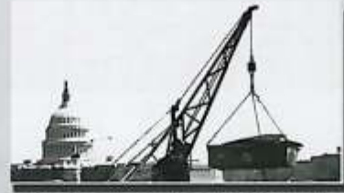
For years, Garlock Hydraulic Hoists are the brand trusted by thousands of roofers nationwide.

Loaded with features, fingertip control and smooth operating performance, you'll soon agree that this is simply the best material hoist on the market.