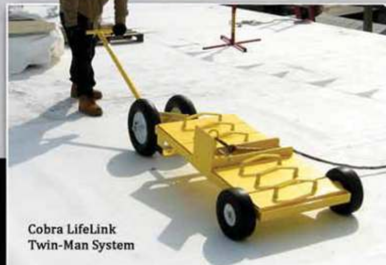
Cobra LifeLink Twin-Man System

MOBILE FALL PROTECTION SYSTEMS WHEN AND WHERE YOU NEED THEM