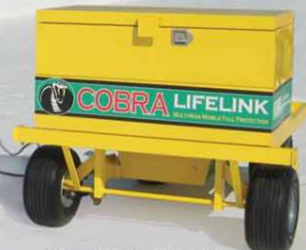
Cobra LifeLink Multi-Man System