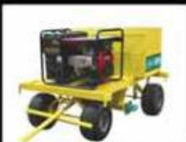
Carry Generators or Compressors