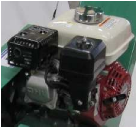
Powerful 6.5 hp OHV Engine

The 3610 is specifically designed for removal of gravel on flat roofs. For the safety of the operator, these machines must be operated within a perimeter warning line system. Eye protection must be worn at all time.