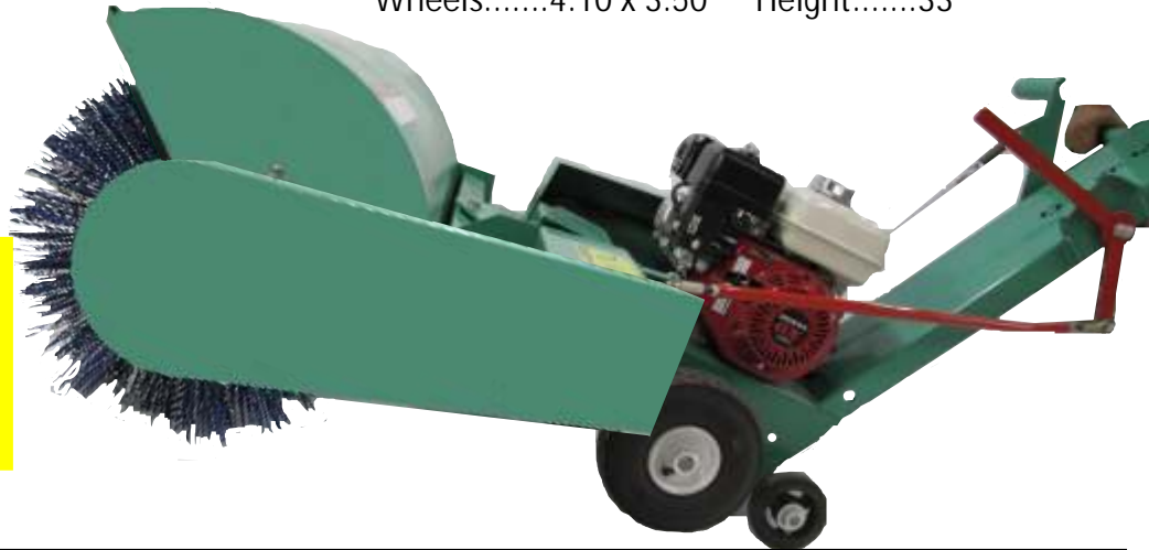
Pivot Wheels Make turns At End Of Run Easy!

Specifications. Length.....77" Weight.....250 lbs. Width.....44" Wheels.....4.10 x 3.50 Height.....33"